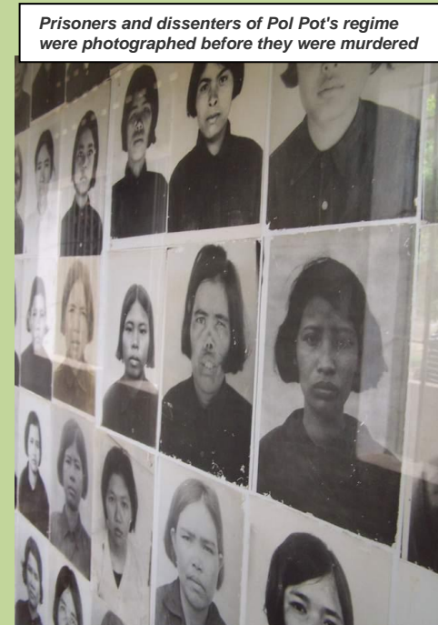
Prisoners and dissenters of Pol Pot's regime were photographed before they were murdered

This unique opportunity to intern for the United Nations again is something I am very passionate about doing. UNAKRT works alongside the ECCC to prosecute people responsible for crimes committed during the period of Democratic Kampuchea/Khmer Rouge from 1975 to 1979. These crimes occurred during the Communist reign of Pol Pot where 1.7 million people were executed (commonly called the "killing fields") in pursuit of Pol Pot's plan to block the borders, shut out the world, separate families, imprison dissenters, brainwash his citizens, and create an agrarian society of automatons. The horrors committed during this period are almost too much to fathom, and the role of the tribunal is to hold accountable those leaders that are responsible for these atrocities, to bring truth and reconciliation to Cambodia and, hopefully, to prevent further evils of this kind. I will be working for the first time in the Prosecutor's office, gaining valuable experience in a civil law influenced tribunal, working on very unique legal issues, and I will have the opportunity to turn this internship into a job. I am really honored by this opportunity and can't wait to get over there.