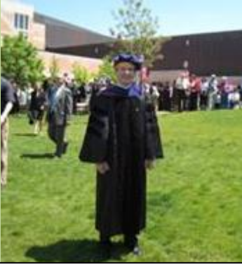
University of Denver College of Law 2007

As you might know, I recently graduated from University of Denver College of Law. During my time there, I discovered that the field of international justice is where my heart is. I have just been offered a terrific internship to work in Cambodia for the United Nations Assistance to the Khmer Rouge Trials (UNAKRT) in the Office of the Co-Prosecutors of the Extraordinary Chambers in the Courts of Cambodia (ECCC) . However, given my limited financial resources at this time, I am asking friends and family to help realize this dream. I would be so grateful if you could take a few minutes to read this letter to find out more.