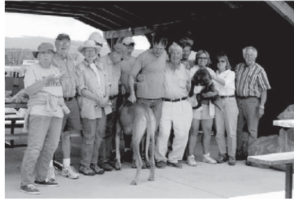
WP/FV Rotarian's (and friends) at it's Fraser river clean-up project at the Lion's pavilion near Safeway

equipment. In general, typical box contents could include: