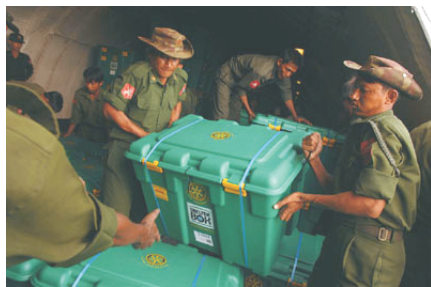
Myanmar authorities help to unload Rotary Int. Shelter Boxes from a chartered aircraft

Rotary International, partly because of the trust it has earned fighting Polio and through other international aid programs, was the first assistance organization allowed into Myanmar following Cyclone Nagris. Rotary was in Myanmar delivering Shelter Boxes to displaced families as early as May 8th, just four days after the devastating storm.