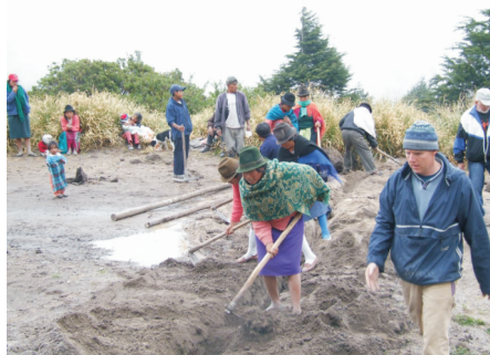
building an irrigation system in Malingua Pampa, Ecuador

This will be a very informative evening. Find out what it takes to help out as a volunteer; either here or in Ecuador. The presentation will take place at Beavers Village Lodge in Winter Park at 7:00 pm. Cost is $10 per person. A buffet style dinner is also available at Beavers beginning at 5:30.