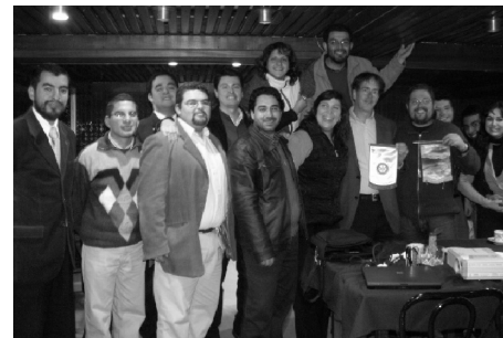
The San Cristal de Santiago Rotary Club - Santiago, Chile

So it's true; around the world there are 1.2 million people who will welcome you into their homes and give the shirts off their backs, all because they know that you and they all share that same commitment for "service above self". (and of course pisco.)