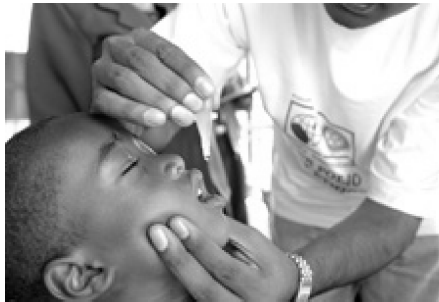
A Rotarian immunizes a child against polio. Addis Ababa, Ethiopia.

Rotary leads private-sector participation in the global effort to eradicate polio. The value of the half-billion-dollar program is multiplied by the thousands of volunteers in more than 100 countries helping to immunize children.